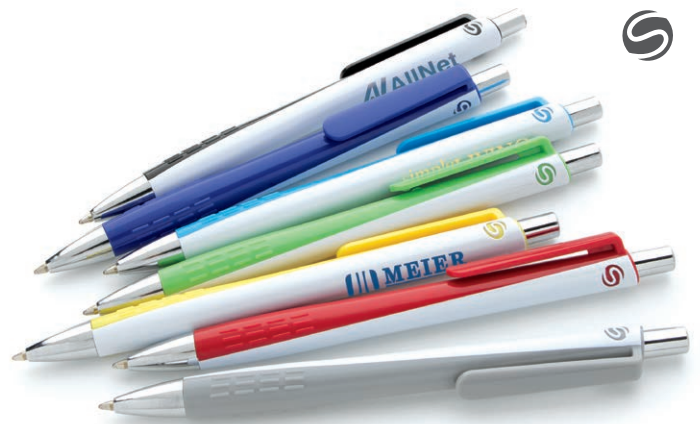
55934 | Souvenir® TFW Pen