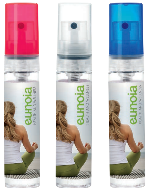
40916 | Hand Sanitizer Spray - 10ml*