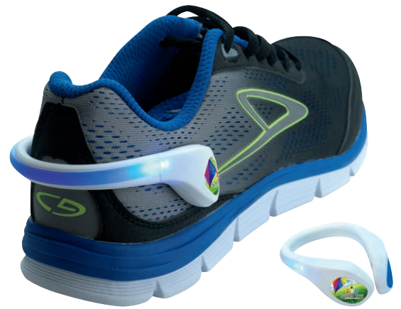
41028 | Safety Shoe Light

Pending tariff implications and the associated impact on raw material costs, BIC Graphic reserves the right to change prices at any time, without notice if necessary. Please see bicgraphic.com for up-to-date pricing. BIC®, the BIC Graphic logo, bicgraphic.com, Souvenir® and all related trademarks, logos, and trade dress are trademarks or registered trademarks of BIC Graphic and/or its affiliates or licensors in the United States and other countries and may not be used without written permission. ©2019 BIC Graphic, Clearwater, FL 33760.